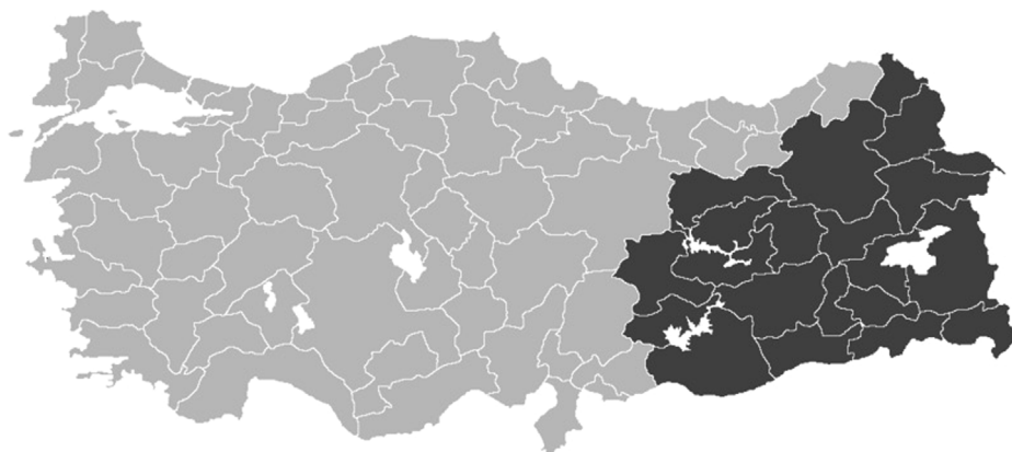
Fig. 1. Majority kurdish provinces in Turkey (grey).

Consequently, within the more Islamic-based southeast, patriarchal dominance was established and maintained through women's diminished access and participation in education, and through culturally accepted inequitable marriage and reproductive practices. This paper seeks to observe explicitly whether patterns of emancipation vary between this region and the rest of the nation and to evaluate whether these two contexts are associated with distinctive impacts on the relative level of female incarceration. As any relationship between gender equality and offending is likely non-linear across ranges of gender equality, Turkey provides an ideal case in which to begin to explore whether the null findings found in the previous literature were perhaps a function of the unique level of emancipation enjoyed by English-speaking Western women in the post-World War II era. As southeastern Turkey was socially insulated from previous advances in gender equality (Kandiyoti and Kandiyoti, 1987), recent increases in gender equality in the